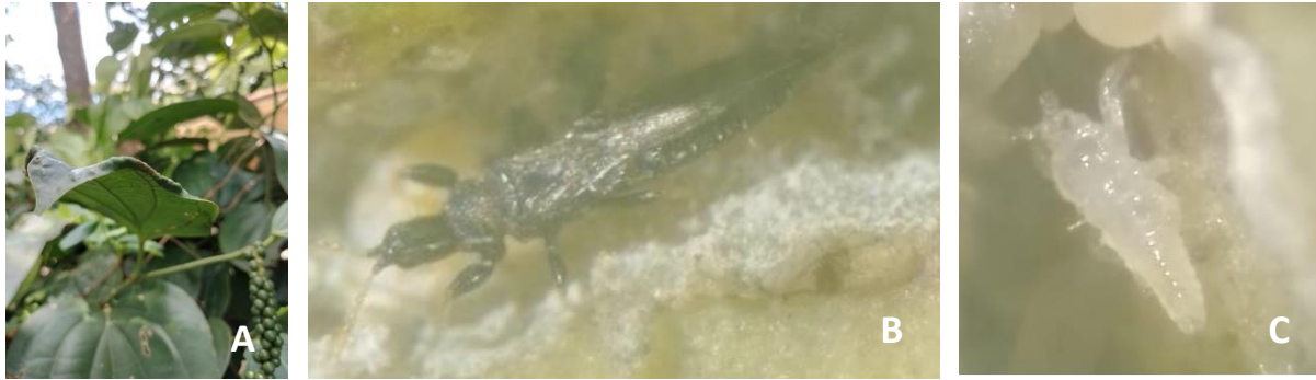
Fig 1.0 Pepper Leaf Gall Thrips A - Damage on Pepper Leaves B - Adult Thrips C - Nymph of Pepper Thrips